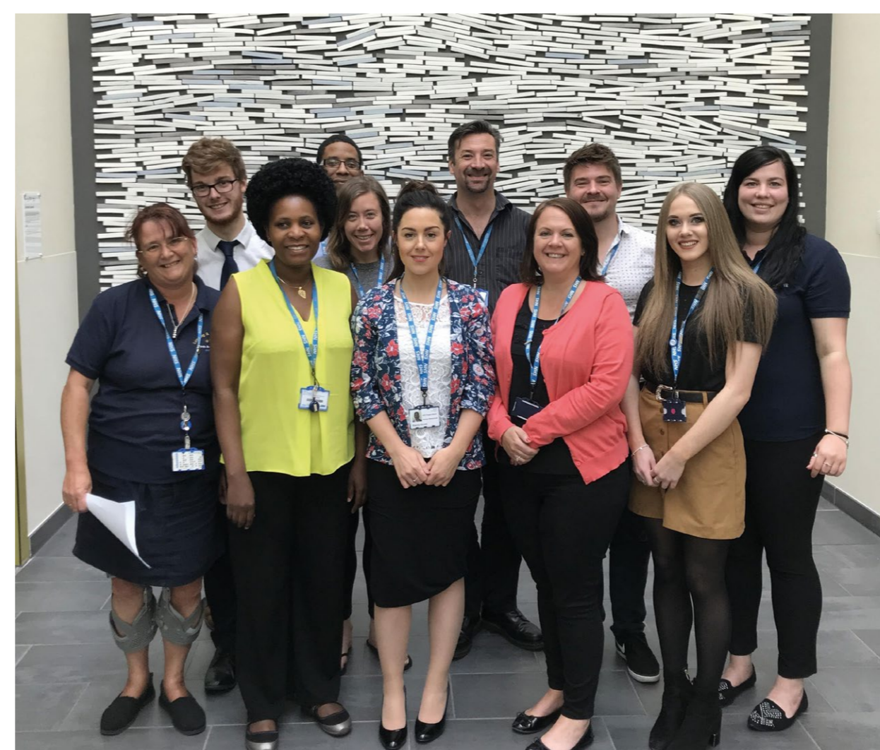
The people in the photo above are just some of our dedicated unregistered colleagues from across BNSSG Trusts